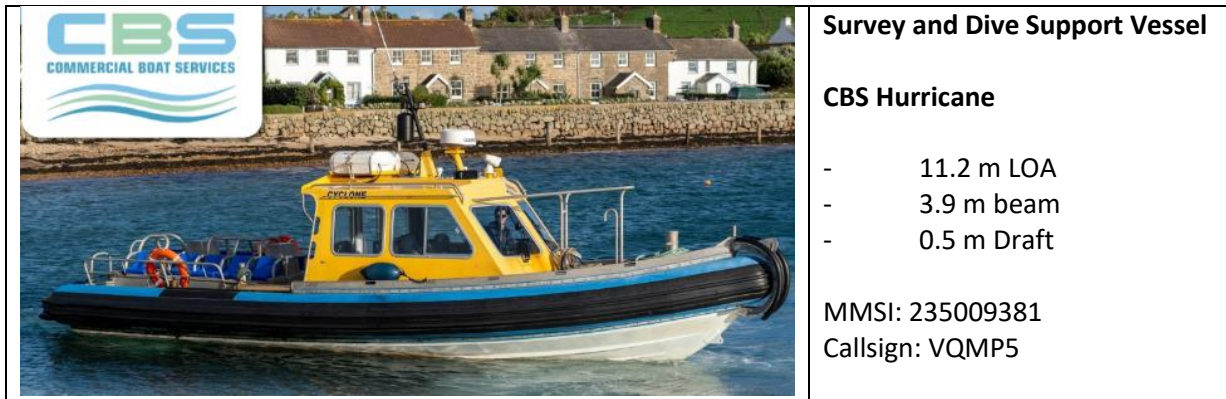
Figure 1 - Vessel Specification